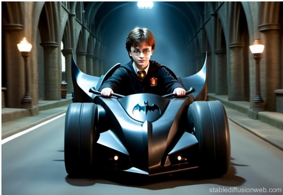
AI generated (with stablediffusionweb.com)